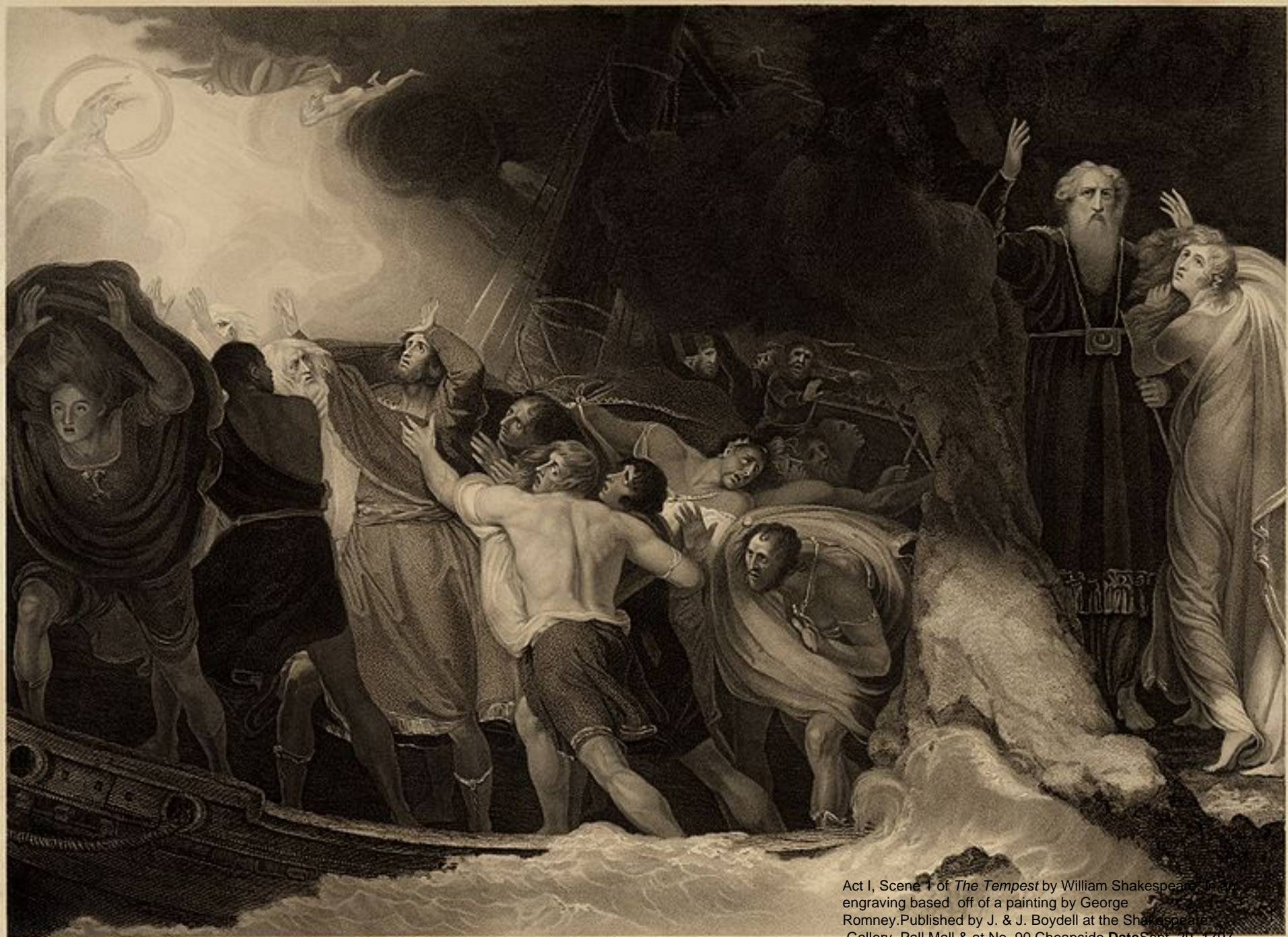
Act I, Scene 1 of The Tempest by William Shakespeare, in an engraving based off of a painting by George Romney. Published by J. & J. Boydell at the Shakespeare Gallery, Pall Mall & at No. 90 Cheapside. Date Sept. 29, 1797 (Engraving)